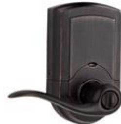
INTERIOR VIEW (11P VENETIAN BRONZE FINISH)