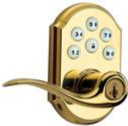
3 BRIGHT BRASS