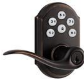
11P VENETIAN BRONZE