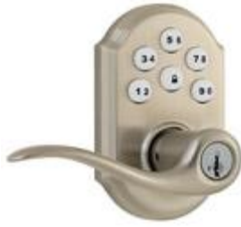
15 SATIN NICKEL